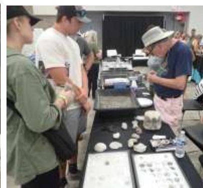
2026 North Carolina Shell Show at Crystal Coast Civic Center