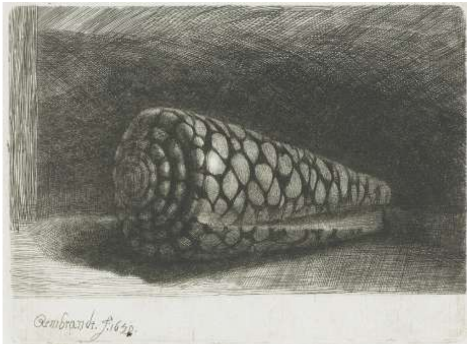
Etching of Marble Cone, Rembrandt f 1650

Any non-competitive art exhibit/installation. The entry still qualifies for People's Choice Award, Art.