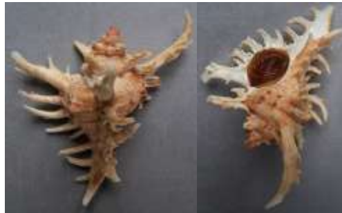
Lot 20 Asian Murex Chicoreus asianus Kuroda, 1942 w/op., 110.5mm