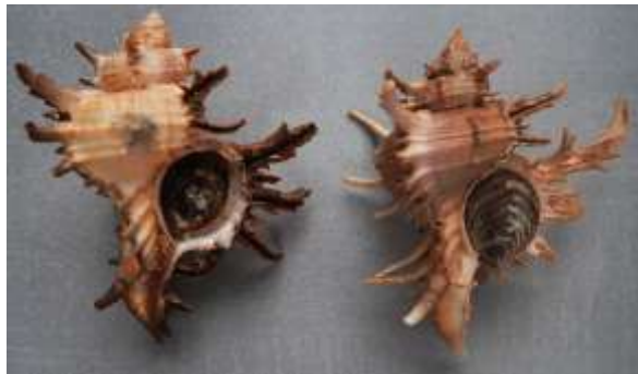
Lot 19 Monodon Murex, 2 shells Chicoreus cornucervi (Röding, 1798) w/op., 80.4-83mm