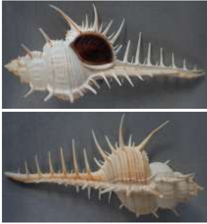
Lot 62 Trochel's Murex Murex troscheli Lischke, 1868 w/op., No data, 159mm Gift of Mique Pinkerton