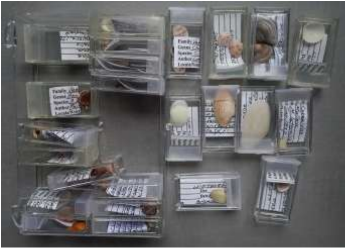
Lot 17 Miniature Shells Collection, 24 species Courtesy of North Carolina Shell Club, Everett Long Collection